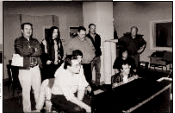
RIGHT: Listening groups were kept small to allow everyone to get close enough.