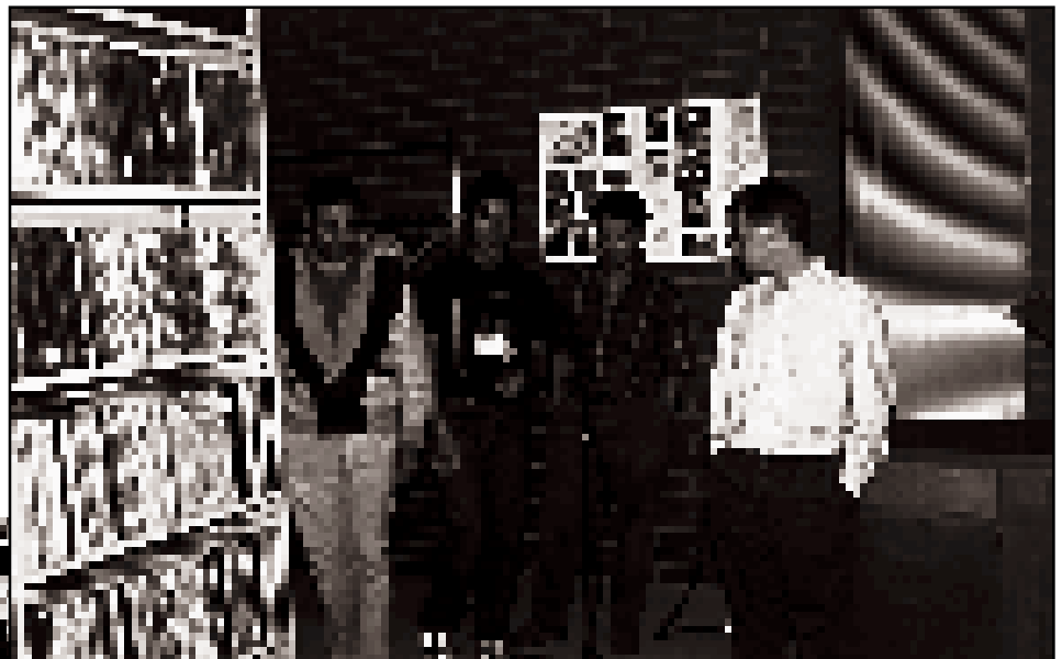
ABOVE: Examining the remote measurement mics.