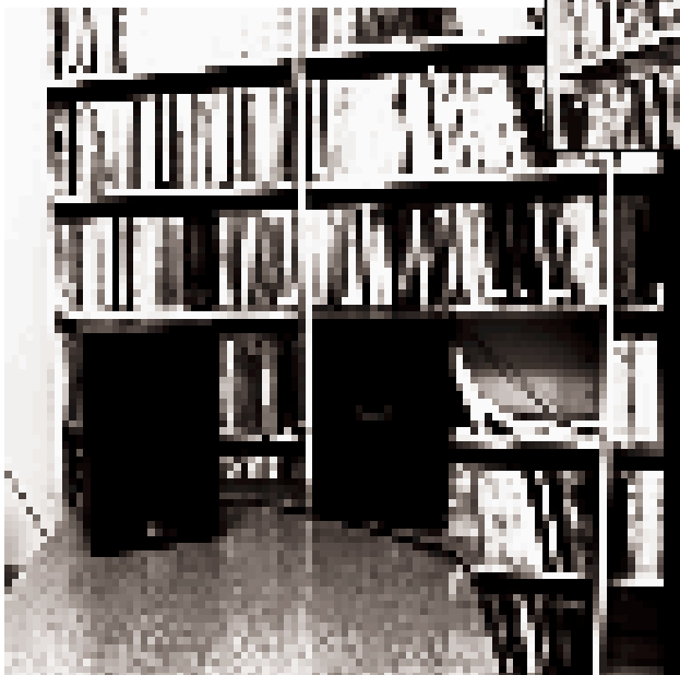
LEFT: Speakers used in SIM test situation were intentionally placed out of time alignment in a room acoustically aberrated by recorded audio media.