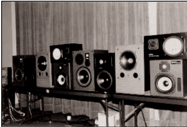
ABOVE: Table full of near-field monitors.