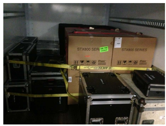
View of gear loaded into truck.