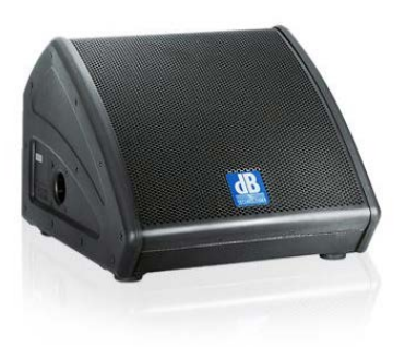
DB Technologies M10-2 powered monitor