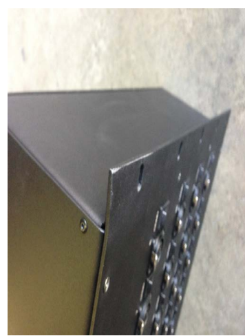
Stage box for snake. Note the bent corner.