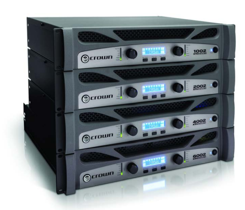
Crown Xti 6002 power amp The 6002 model is the bottom one of the stack of amps.