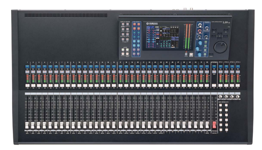
Yamaha LS9-32 digital mixing console