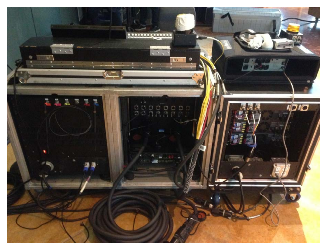
Rear view of the picture at the left of this one. In the amp rack at the right, you can see the custom AC panel with the L14-30 twistlok connector and the quad box.