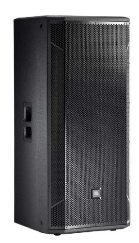
JBL STX835 dual 15" horn loaded speaker, with grill