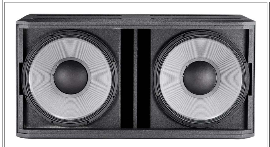
JBL STX828 dual-18 subwoofer