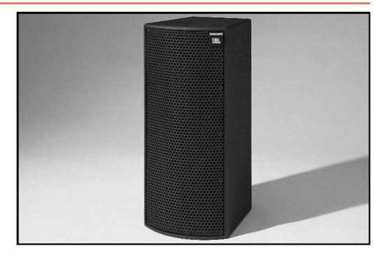
JBL MS26 2x6" + tweeter