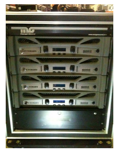
Custom amp rack with four Crown Mti 6002 amplifiers