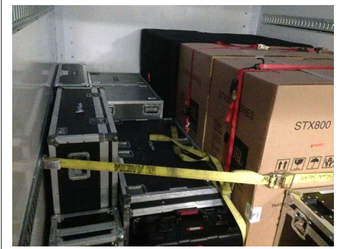
View of gear loaded into truck.