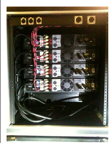
Rear of the custom amp rack. Not shown is a custom AC panel with L14-30 twistlok connector and rear-mounted 20-amp quad box.