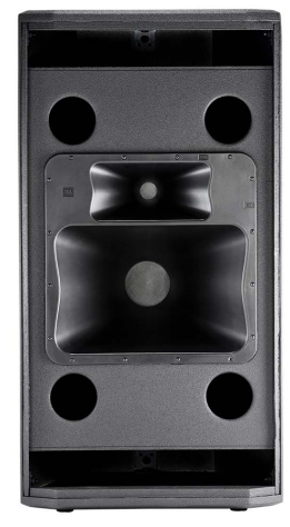
JBL STX835 dual 15" horn loaded speaker