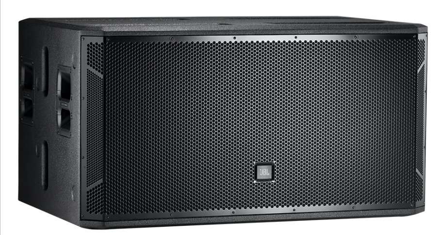
JBL STX828 dual-18 subwoofer, with grill