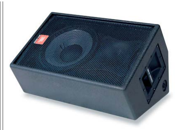
JBL SR4702x 12" 2-way floor monitor.