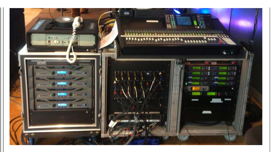
The crown Xti 6002 amp rack at the left. The IEM gear on the list may be on the right. The Yamaha LS-9 console is on top of the racks, and the clear-com CS-222 master station is on the left. Note that the Clear-Com master station is mounted into a 2U portable rack case.