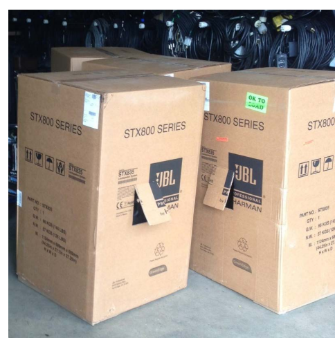
JBL STX-835 dual-15" two-way. Note that these were NIB (New In Box). See R5C1, R5C2 for pictures of the speaker outside of the box.